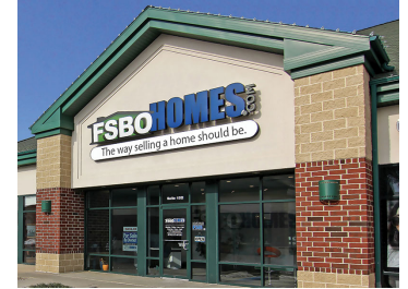
FSBOHOMES Cedar Rapids 576 Boyson Rd NE, Ste 102 Cedar Rapids, IA