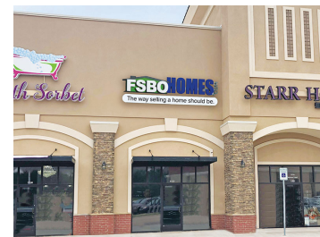
FSBOHOMES Oklahoma City 15124 Lleytons Ct, Ste 113 Edmond, OK