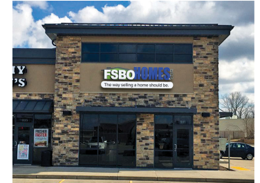
FSBOHOMES Quad Cities 901 Middle Road Bettendorf, IA