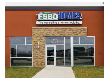
FSBOHOMES Dubuque 800 Wacker Dr, STE 102 Dubuque, IA