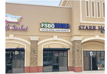
FSBOHOMES Oklahoma City 15124 Lleytons Ct, Ste 113 Edmond, OK