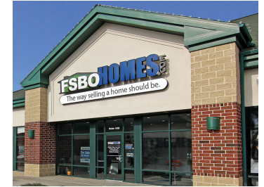
FSBOHOMES Cedar Rapids