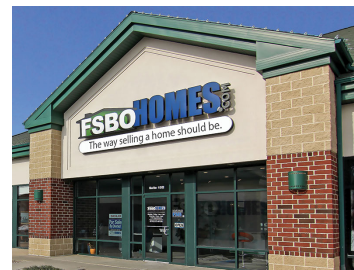
FSBOHOMES Cedar Rapids