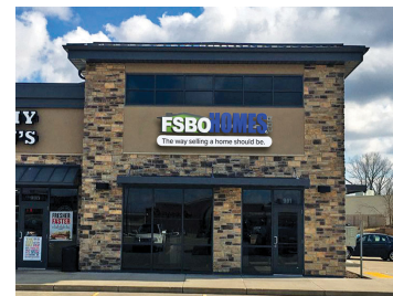
FSBOHOMES Quad Cities